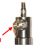
Open – Keyring Vertical

Please note system will not operate with isolate valve in closed position