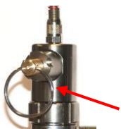
Closed – Keyring Horizontal

Optional FT0124 pressure switch can be fitted in spare gauge adapter on head assembly or at end of line. Or discharge confirmation switch can be fitted in the spare discharge port or in the discharge pipe work using adapter provided.